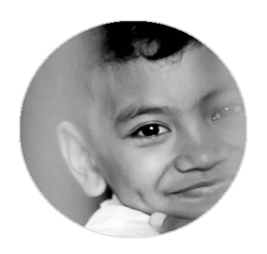
ONE DAY, ALL FILIPINO CHILDREN

will have access to an inclusive, relevant, and excellent education.